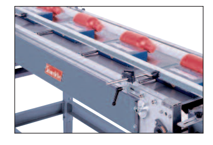
Adjustable Flight Bar Infeed

By selecting just the right combination of options you can customize your Hy-Speed wrapper for the ultimate performance, efficiency and value!