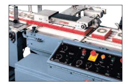
Harmonic Overhead Infeed