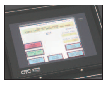
Full Color Touch Screen