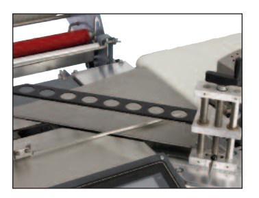
Adjustable Inverting Head (HS-1 and HS-3 only)