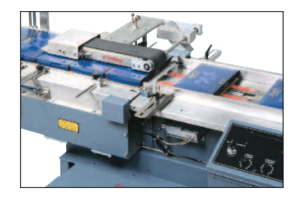
Synchronic Overhead Belt Infeed