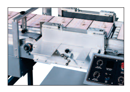
Harmonic Side Belt Infeed